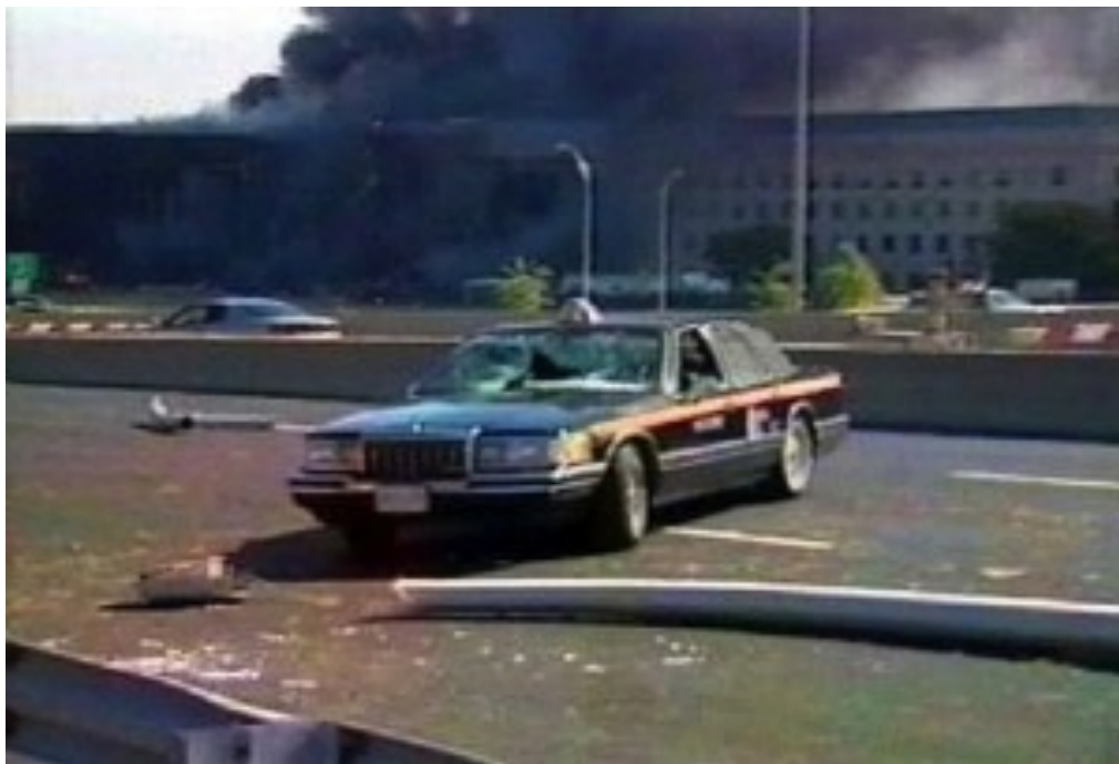
Taxi hit by felled light pole, pole 1

It would have been very difficult to create a convincing illusion of a plane crash however, because the damage trail was long and complex. The first major damage included the severing and felling of five light poles. The first of these poles impaled a taxi through its windshield. It would be very difficult and risky to fake this achievement in real-time.